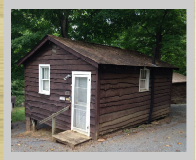
The Old Infirmary

A much needed improvement is underway...Nurses at Camp Ta-Pa-Win-Go will be welcomed next summer with a completely renovated infirmary, thanks to generous giving and lots of hard work by a group from RVICS (Roving Volunteers in Christian Service). We praise the Lord that our goal of $15,000 has been met. Additional volunteers will be needed to complete the plumbing, electrical, sheet rock, flooring and painting.