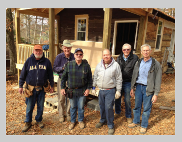
The RVICS men who did it!