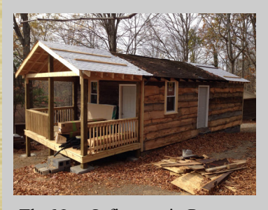
The New Infirmary in Progress