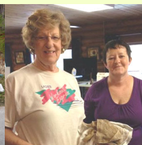
Camp Grace volunteers refinished the dining hall/kitchen floors