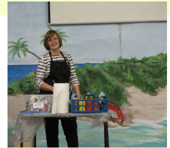
Camp Victory's volunteer paints the backdrops for camp