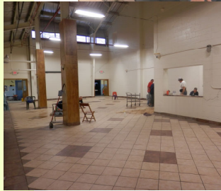
Cornerstone Ministry Center, SWPA volunteers tiled over a 1200 sq. foot dining room Isn't it beautiful!