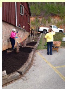
Many volunteers work hard at TRC in April to ready the place for a summer of rentals!