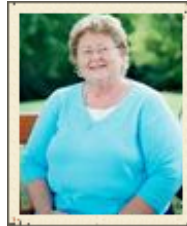
A few of my favorite activities with CBM over the years!

Registrar for camps, being a counselor, teaching Released Time & Bible classes, Senior Citizens and Singles ministry, cooking and baking for large crowds, grading Mailbox Lessons, working with volunteers, office work, and using my creative abilities to further the Kingdom of God!