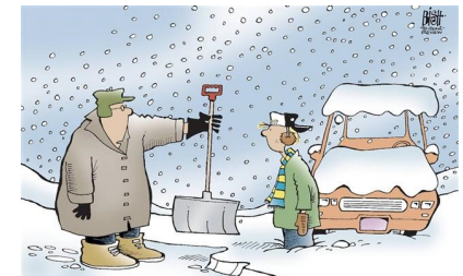
SORRY, SON...THERE'S NO APP FOR THAT

Phone: 865-448-1200 (CBM); 865-448-6442 (TRC) Fax: 865-448-1233 E-mail: cbmoffice@childrensbibleministries.org Website: www.childrensbibleministries.net